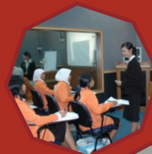
Micro Teaching Laboratory