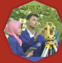
Outdoor Laboratory of Geography