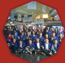
A visit to Jawa Pos Newspaper Company