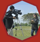
Outdoor Laboratory of Audio Visual