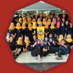
A visit to BPPM- DIY